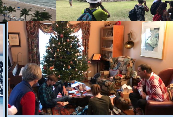
Top-left: A beach in Ft. Lauderdale. Top-right: Mayan Ruins in Costa Maya. Bottom: Christmas at home.

This is one of my last quarters of "real" classes—what comes next??